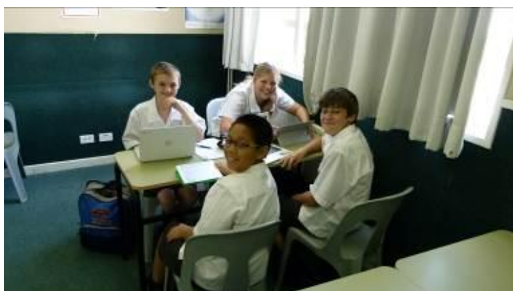
Digital Citizenship Day