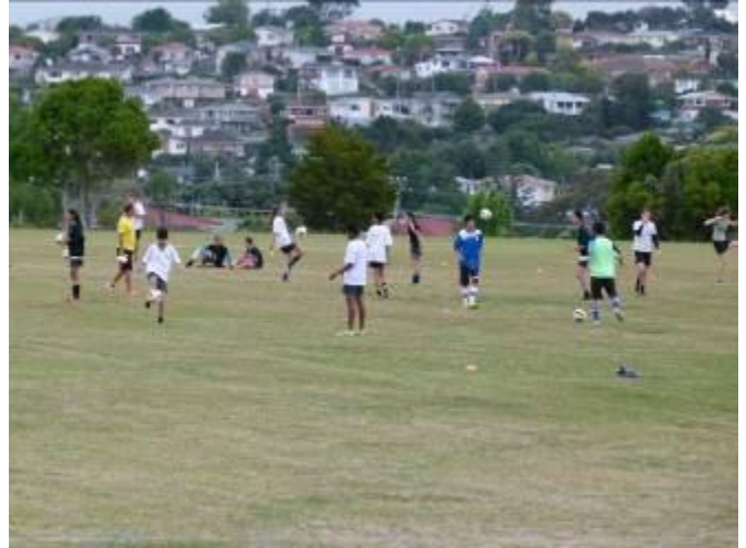
Academy Sport – early morning practice